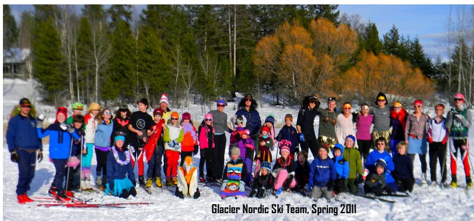
Glacier Nordic Ski Team, Spring 2011

Membership benefits include Ski Pass at Glacier Nordic Center at Whitefish Golf Course; supporting your local youth/masters programs; $5 off Chet Hope Ski League; and GNC annual newsletter. All skiers must have a current GNC membership or purchase a daily trail pass for $8. Return completed form with a check payable to Glacier Nordic Club, P.O. Box 403, Whitefish, MT 59937.