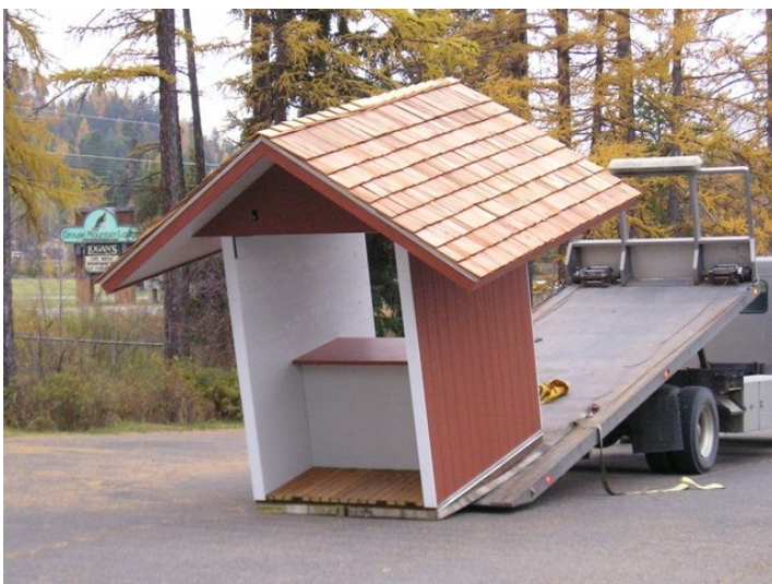
New Trailhead Kiosk being delivered to Glacier Nordic Center Ski Trails at Whitefish Golf Course.

The Glacier Nordic Club will have a new face this year at the Glacier Nordic Center ski trails on the Whitefish Golf Course.